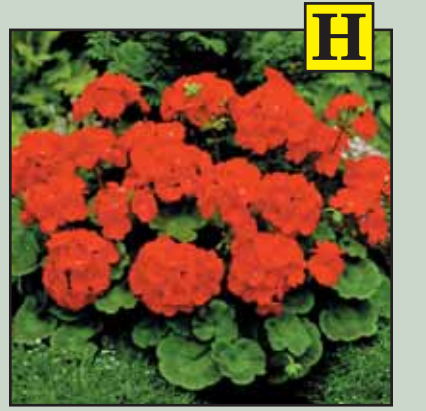
H Geranium Hybrid Red Our hybrid red geraniums keep blooming and growing all season long. Plants grow 12"-14" tall. 14 - 4 inch pots. I Geranium Hybrid White Also available but not shown.

Also available but not shown: E Petunia Red F Petunia White G Petunia Blue