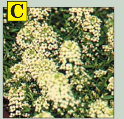
C Alyssum White Dainty pure white flowers cover low growing plants to create a beautiful carpet of snow. Excellent border plants.