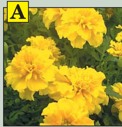
A Marigolds "Yellow Boys" These little guys really get up and grow. Lemon yellow blooms cover 8"-10". Compact, sun-loving plants. (Helps to keep garden pests away.)