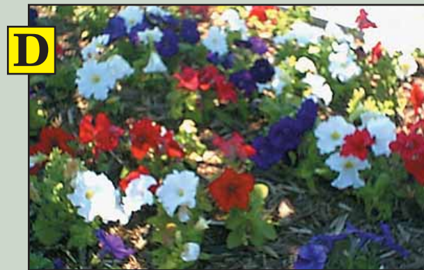
D Petunia Mix These petunias bloom like crazy all summer long. We're nuts about these petunias and we think you will be too! Plants do best in full sun.

Also available but not shown: E Petunia Red F Petunia White G Petunia Blue