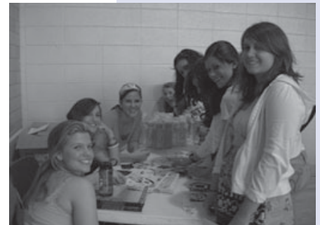
Students who brought in Nalgene bottles were provided stickers to decorate and personalize the bottles!