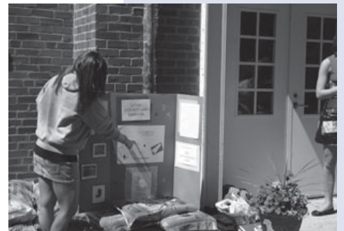
Students attended the dedication of Courtyard Garden and displayed the landscaping plan.