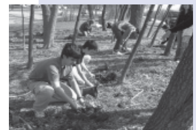
LFHS Foundation supports the bike path beautification project. Students plant during Earth Week.