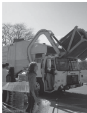
City of Lake Forest recycling truck - funded by the recycling of residents - helped with recycling of water bottles at LFHS.