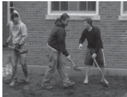
The Men's Club volunteered to help the Environmental Club with the Courtyard Garden beautification project.