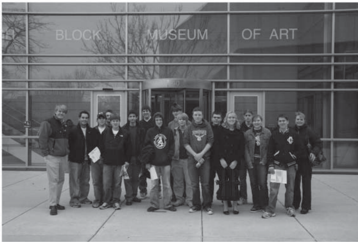
Telecom and Animation students visit the Block Museum at Northwestern University to view the Alfred Hitchcock exhibit of storyboard and collaboration.