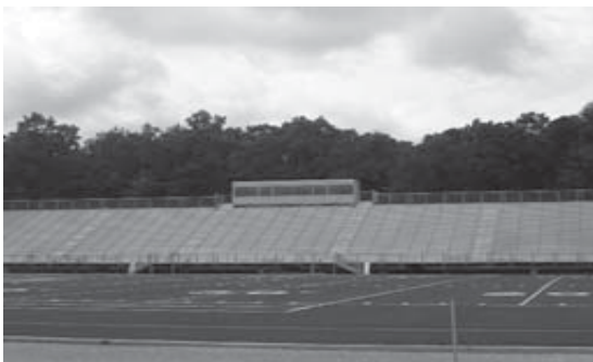
The new Scout's Varsity Field at West Campus will host Homecoming on September 15.