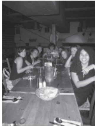
Enjoying an authentic Québécois meal.