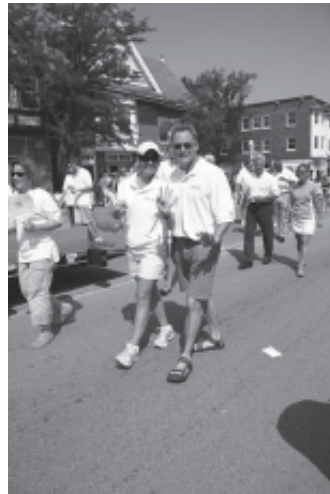
Teachers (above) and Cheerleaders (below) marched with spirit.