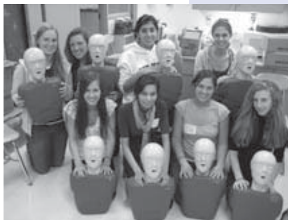
Red Cross Club takes a CPR Class