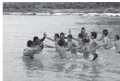
Men's Club doing the Polar Bear Plunge that was held at the Lake Bluff Beach on March 8.