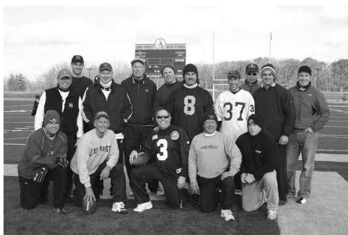
LFHS families enjoyed access to the new Varsity field and brunch post-Thanksgiving Day, after bidding on and winning package at last year's FUNdraiser.

All family home phones have been entered into the system but we urge you to verify and update your information by following the instructions found on pages 22-23.