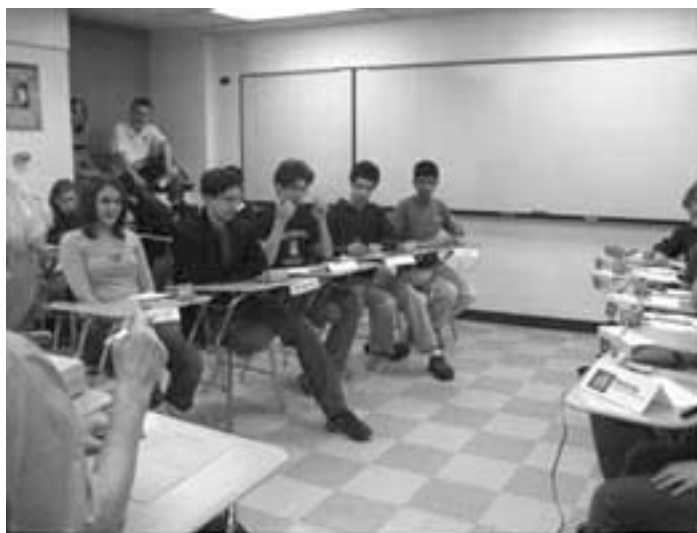
Pictured above: Scholastic Bowl members at a meeting last year.

Parents and Juniors are encouraged to attend this informational session on junior year standardized testing and find out about Naviance. Naviance provides a college search, college admissions data, and will provide your son/daughter a realistic way to compare grades and test scores with previous graduates and the colleges and universities they are now attending. Don't miss this important program!