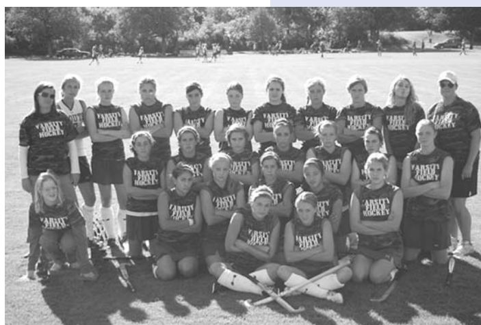
The varsity field hockey team is serious about reclaiming the state championship! Come out and cheer them on!

Remember, both exams must be re-taken for these new test scores to be considered. You will be contacted with your room assignment for October 28.