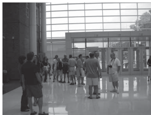
Pictured above are the classes of 1959 and 1979. Below are the graduating classes of 65,67,68,69.