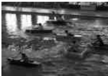
Matt Lowry's Physics class enjoyed creating boats and testing them in the pool at LFHS!