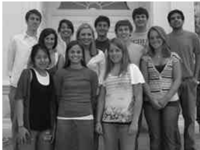
Thanks to the Student Council members who made this year a success!