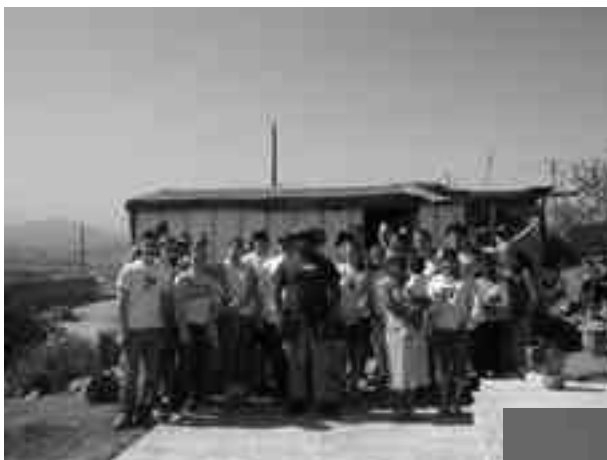
Students are shown in Mexico building homes.