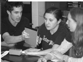
On January 23 Scholastic Bowl met at Zion-Benton High School where LFHS won all of its rounds.